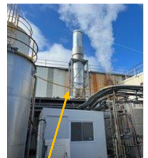
Left: Old hood exhaust #2 stack.